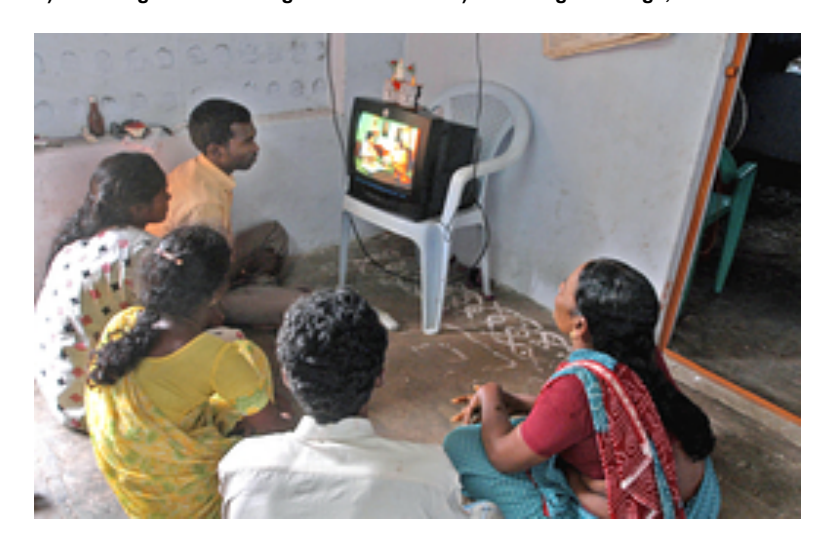
PASSIVE Child Care

Taking care of the child on the side while actively engaged in another activity/task